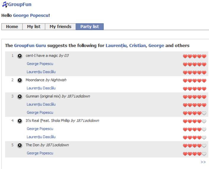
Fig. 1. "Party list" tab in GroupFun